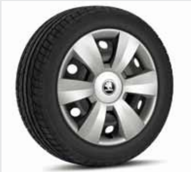
Dentro Available in Active variant