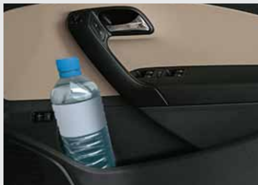
Bottle holders in doors