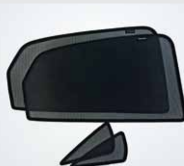
Sunblinds (Set of 4 Pcs)