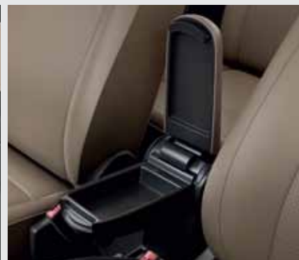
Storage compartment in the front centre console, under front centre armrest