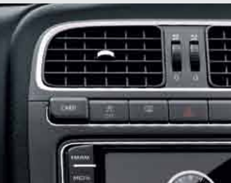
SmartClip card holder