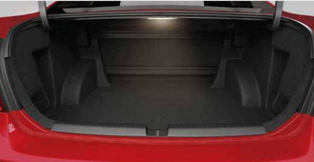
460 litres of illuminated luggage compartment space

A good relationship is one where you get enough space to yourself. And the new ŠKODA Rapid is the perfect partner which is thoughtfully designed to accommodate you and everything you might ever need.