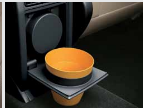
Cup holders, front and rear