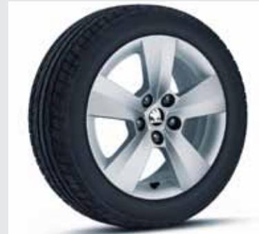
Matone Available in Style variant

Nano Ivory - Fabric Available in Active and Ambition variants