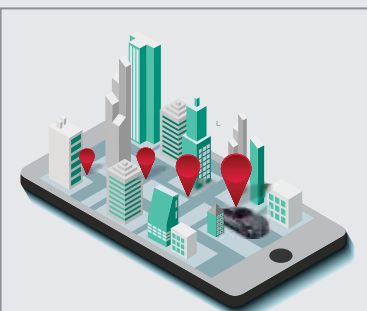
Track Pro Device