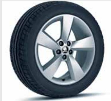
Bold Available in Ambition variant